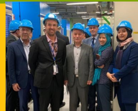
Visiting CERN- Geneva