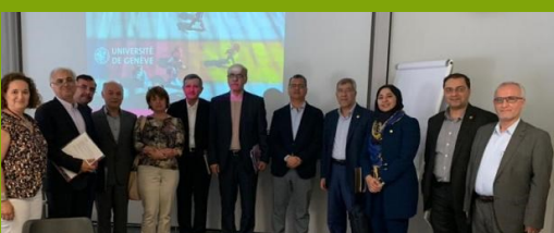
Visiting University of Geneva