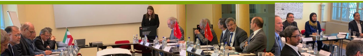
The Second Meeting of Iran-Switzerland scientific and technological working group- SERI- Bern

To have more information about this science tour you may visit our news at the following website: iscoweb.iut.ac.ir