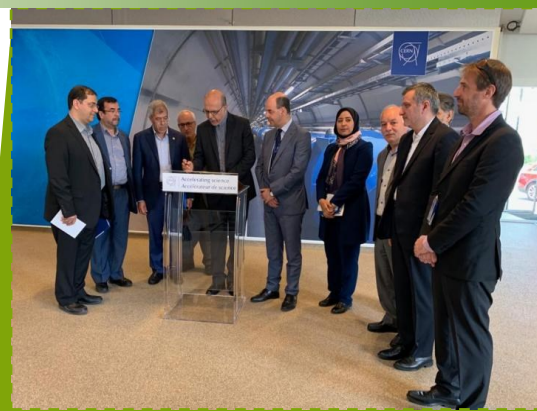
Iranian high-ranked delegation visiting CERN

https://international-relations.web.cern.ch/stakeholder-relations/states/iran