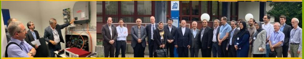
Iran- Switzerland Joint Workshop- Zhaw- Winterthur